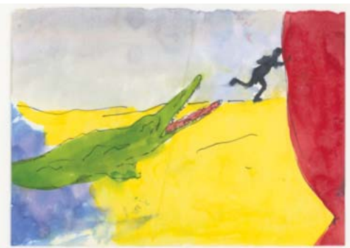
Untitled , 2016