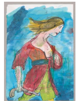
Untitled , 2018