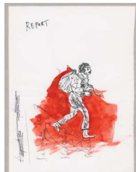
Untitled , 2018