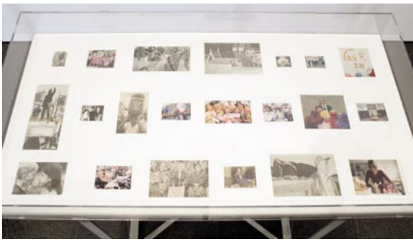
Theory of Justice , détail, 1992-2010