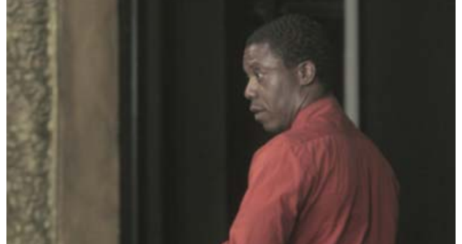
Report , 2016