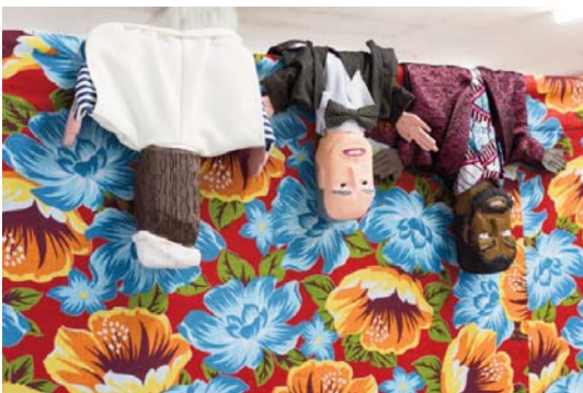
Teatro Popular , détail, 2016-2017