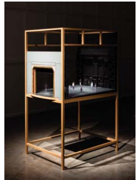
Teatro (Report) , 2016-2018