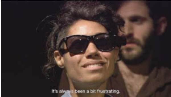
Study for Social Dreaming , 2014-2017