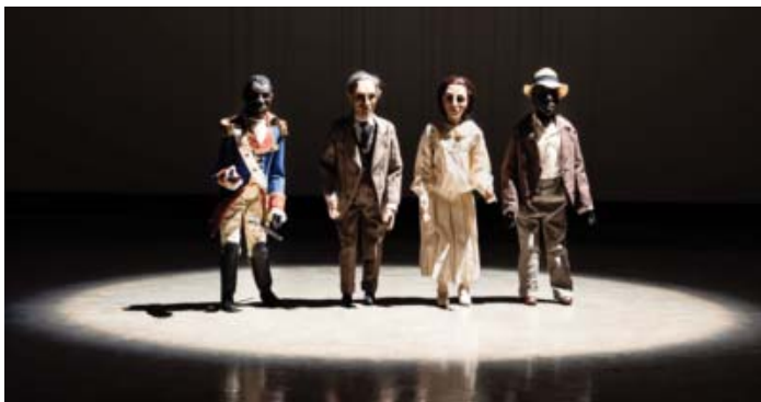
The Dramatist (Black Hamlet, Crazy Henry, Giulia, Toussaint) , 2013