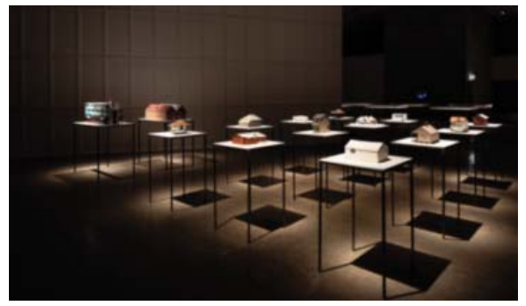
Rehousing , 2012-2019