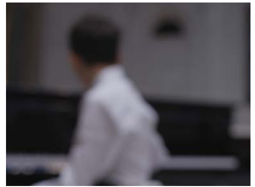
The Custom House/The Reading Room, 2020