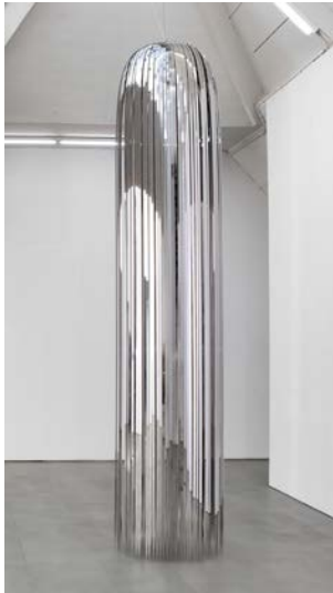
Father Form, 2017