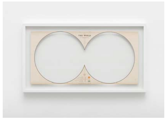
The World, 2014