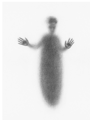
The Window, 2020