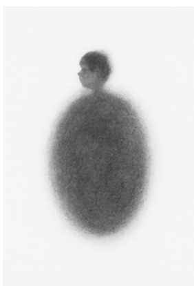
Open Window, 2020