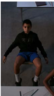
Out of Place, 2020