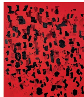
Debris Field (Red) #20, 2021

Contact: Delphine Verrières-Gaultier – Carré d'Art