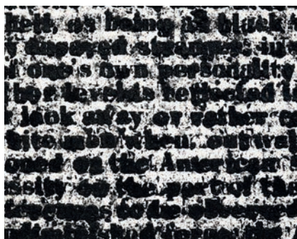
Stranger (Full Text) #1, détail, 2020-21