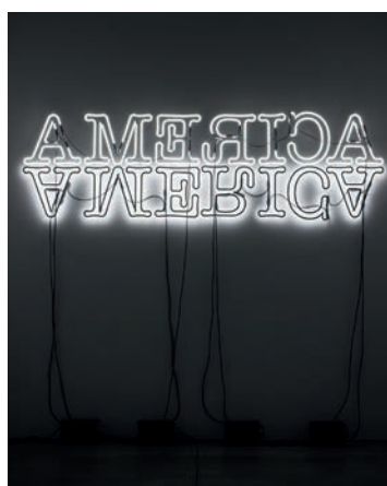
Double America, 2012

« Post-Noir » at Carré d'Art is Ligon's first solo exhibition at a French institution.