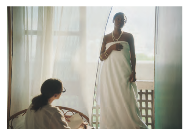
Bright Hours, 2022