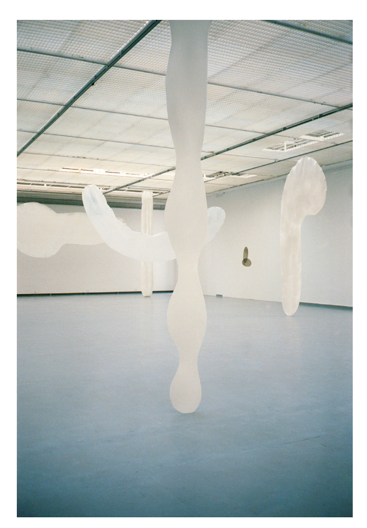
Softeners, 2019. Silicone. Installation view of the show Witness on our Behalf at CAC, Vilnius.