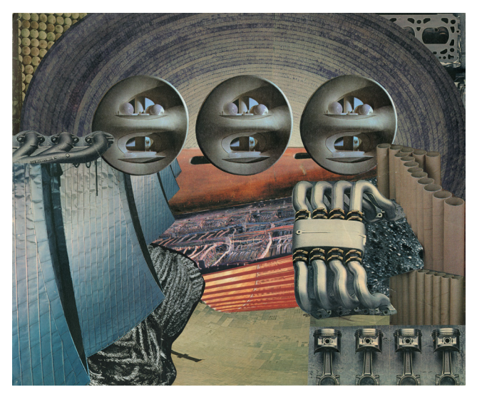
Shell Dwellers. I – XII, 1989. Paper, collage, 35 × 43,5 cm. The Lithuanian National Museum of Art.

CURATOR: ELONA LUBYTĖ 3<sup>RD</sup> FLOOR OF CARRÉ D'ART