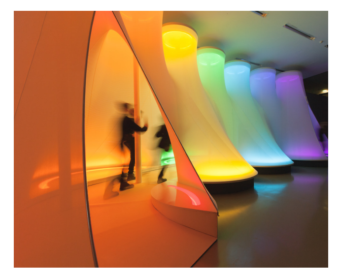
Spectrum. An Afterthought, 1975–2014. Synthetic fabric, neon lamps, colored filters, steel, aluminum, plywood, plastic. 400 x 1056 x 539 cm. The Lithuanian National Museum of Art.