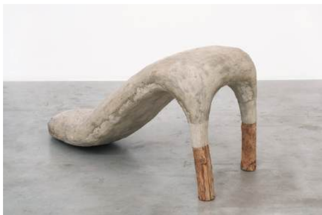
Ivens Machado, Untitled , 1990 Concrete, wood, and gravel 64 x 130 x 53 cm

This exhibition perfectly aligns with Carré d'Art's programming, which recently hosted Nairy Baghramian and Tarik Kiswanson —two artists who question the practice of sculpture within a political context, engaging with the body and performance. It is a way of reinterpreting Ivens Machado's work within a Brazilian context, but also on an international scale. The exhibition will be presented in the Project Room, coinciding with the dates of the Lucas Arruda exhibition, which is also part of the Brazil Season in France.