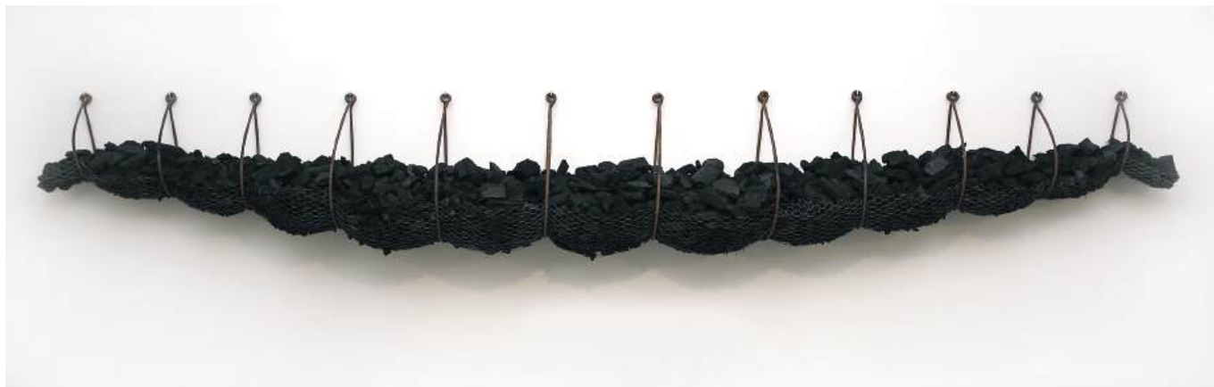
Ivens Machado, Untitled , 2006 Iron, mesh, and charcoal 80 x 50 x 550 cm Unique work in a series of 6 Courtesy Acervo Ivens Machado and Fortes D'Aloia & Gabriel, São Paulo/Rio de Janeiro.

The first part of the exhibition will present a selection of video and photographic works documenting the performances from this period. It will show how social tensions were expressed through the body and performative gesture. Issues of violence, repression, and sexuality are addressed , often in a very explicit manner. These are all themes that Ivens Machado has explored throughout his life through a variety of materials.