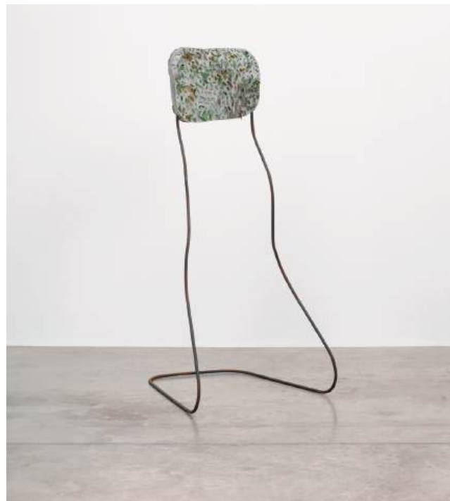
Ivens Machado, Untitled , 1986 Concrete, glass, and iron 179 x 90 x 116 cm

In the second part, these propositions from the 1970s will be linked with his sculptures, which incorporate cement, bricks, iron, and wood—materials commonly used in construction. All of his forms suggest the presence of bodies. They establish relationships between physicality and construction, architecture and ruins , sometimes in a provocative manner. As in his performances, the body and sensuality are also essential dimensions in the development of his sculptural forms. It is interesting to note that his practice is based on the subversion of conventional sculpture , making him one of the undisputed leaders of his generation of sculptors in Brazil , who has influenced many young artists.