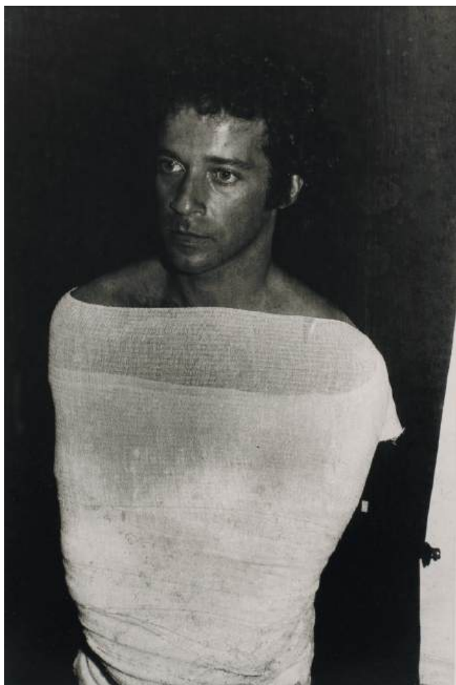
Ivens Machado, Sem Título 14 (Performance com bandagem cirúrgica / negativo #40) , 1973–2018 Gelatin silver print

The exhibition aims to introduce the work of Ivens Machado in France. He belongs to a generation of artists who emerged in the 1970s, following the neoconcretist movement, during the rise of the dictatorial regime.