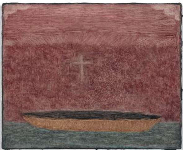
Lucas Arruda Untitled (from the Deserto-Modelo series), 2023 Oil on canvas 24 x 30 cm

His research fundamentally revolves around landscape, the thought process, and the experimentation of our ability to experience life through the mediation of light and vision. His landscapes exist at the point of tension between abstraction and figuration, between appearance and void. With each glance, experiences are defined in a process of construction and reconstruction of memory, as if the formulation of color fields touches the immaterial body of temporal landscapes and lived sensations.