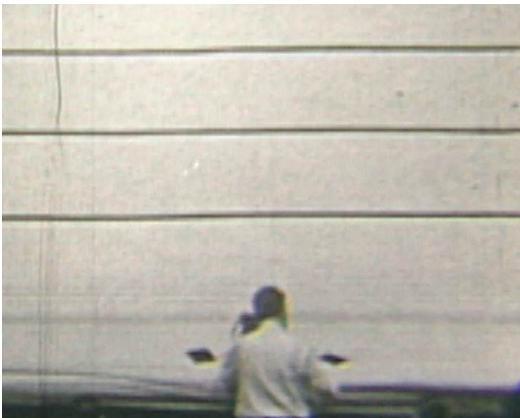
Lucas Arruda Untitled (Neutral Corner) , 2018 Video

The Musée d'Orsay will present a Lucas Arruda exhibition from April 8 to July 20, 2025, in the Impressionist Gallery (5 th floor).