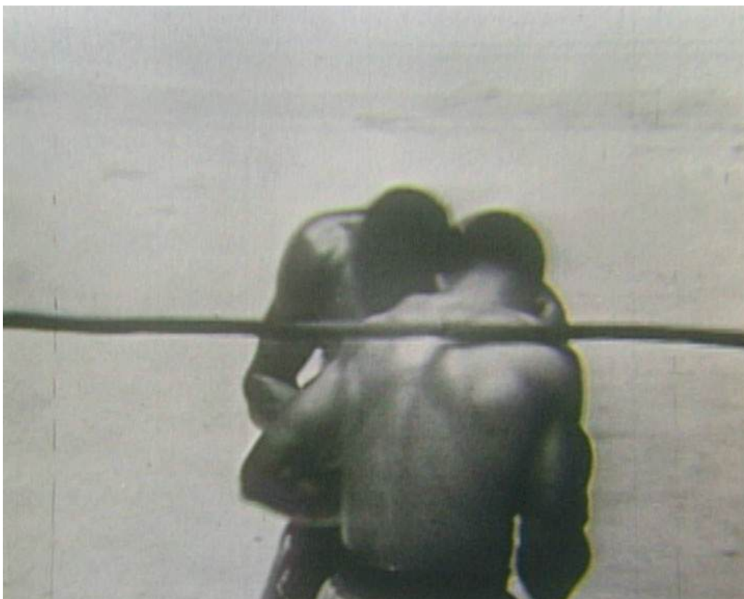
Lucas Arruda, Untitled (Neutral Corner) , 2018 Video