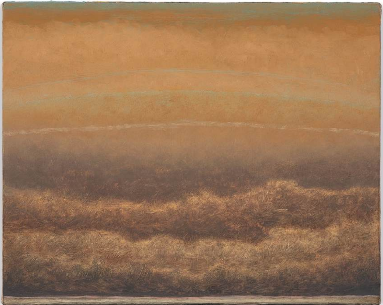
Lucas Arruda Untitled (from the Deserto-Modelo series), 2024 Oil on canvas 24 x 30 cm

His research fundamentally revolves around landscape, the thought process, and the experimentation of our ability to experience life through the mediation of light and vision. His landscapes exist at the point of tension between abstraction and figuration, between appearance and void. With each glance, experiences are defined in a process of construction and reconstruction of memory, as if the formulation of color fields touches the immaterial body of temporal landscapes and lived sensations.