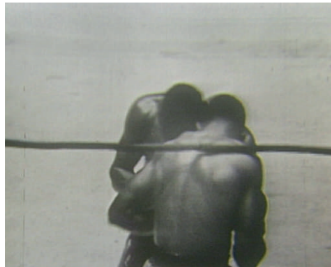
Lucas Arruda Untitled (Neutral Corner) , 2018 Video

An Untitled installation from 2019 is composed of a square of light projected above a painted square on the wall. Arruda calls it a "ideogram of a landscape"—a simplified representation of the horizon, a moment of revelation and a reflection on the relationship between immateriality and materiality. "This balance between upper and lower parts comes from the desire to find a balance between dreams and reality." Lucas Arruda, interview catalog bier Camargo.