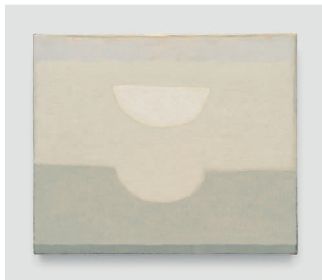
Lucas Arruda Untitled (from the Deserto-Modelo series), 2024 Oil on canvas 30 x 36 cm

From April 30 to October 5, 2025, as part of the 2025 Brazil Season in France , Carré d'Art – Museum of Contemporary Art in Nîmes will host two monographic exhibitions dedicated to contemporary Brazilian artists: Lucas Arruda and Ivens Machado.