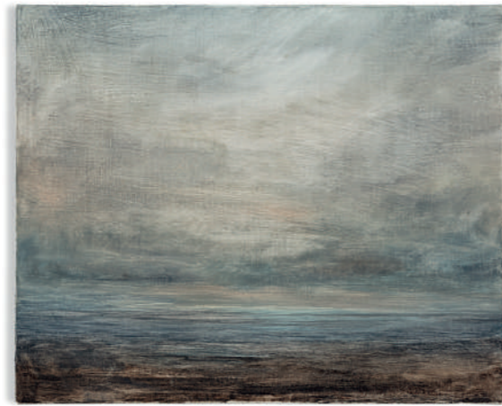
Lucas Arruda, Untitled (from the Deserto-Modelo series) , 2013 Oil on canvas 30 x 37 cm

Faced with Arruda's paintings, one might think of the Impressionists, Turner or the history of landscape painting in Brazil but, less intuitively and perhaps more apt a comparison, Giorgio Morandi also comes to mind. Like Morandi, Arruda always uses the same structure, tending towards abstraction and a metaphysical dimension. As with Morandi, the absence of human figures invites introspection and meditation, while avoiding any narrative. Technically, his work is a question of subtracting and adding matter. In the monochromes, layers of paint are superimposed on a prepared canvas, with the light coming from behind. In the seascapes, paint is subtracted using a fine brush, leaving behind very fine layers of color and light.