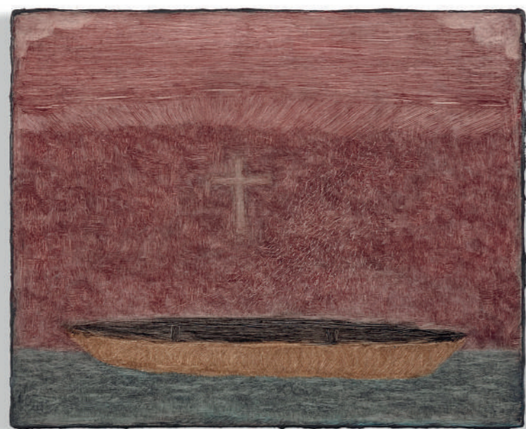
Lucas Arruda Untitled (from the Deserto-Modelo series), 2024 Oil on canvas 24 x 30 cm

Arruda is fundamentally concerned with landscape, human thought, and the experimentation of our capacity to live through the mediation of light and the gaze. His landscapes exist at the point of tension between abstraction and figuration, between appearance and emptiness.