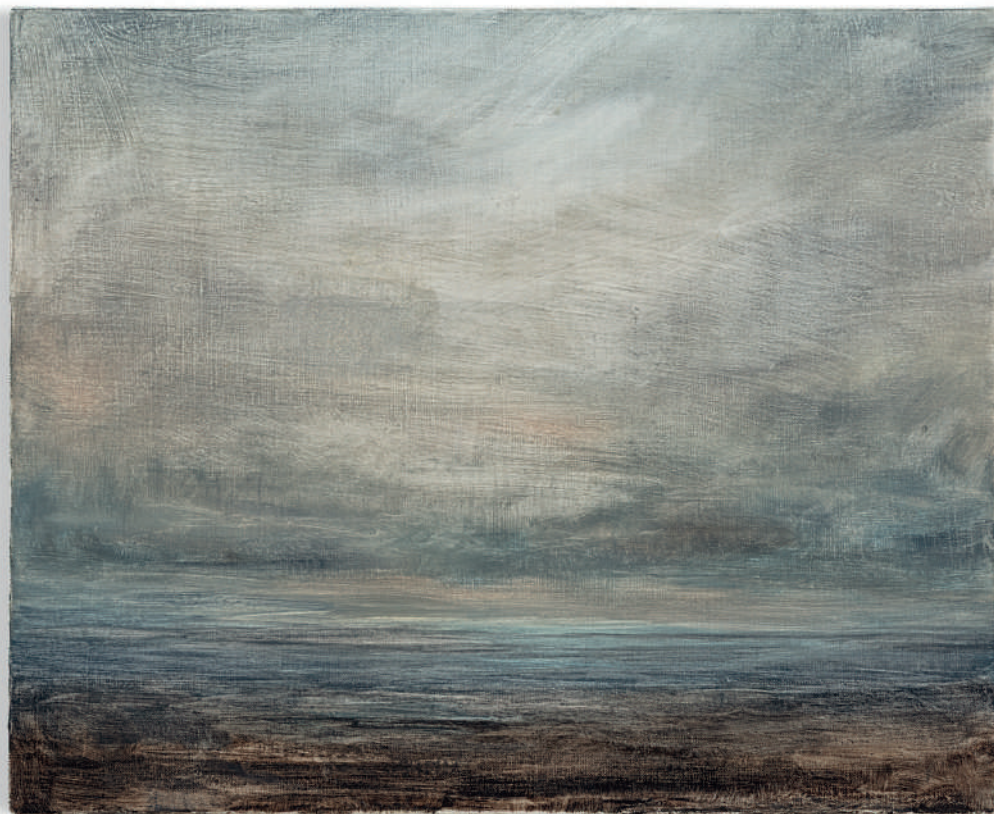
Lucas Arruda, Untitled (from the Deserto-Modelo series) , 2013, oil on canvas, 30 x 37 cm.