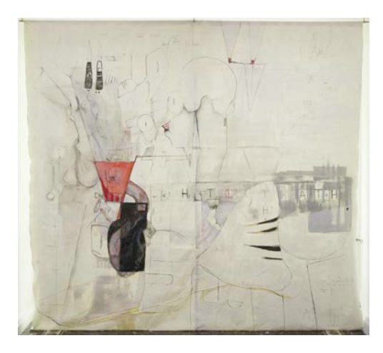
For Cabinet, For Rage, 2014 oil, charcoal, pencil, pastel, acrylic 274 x 300 cm

For the exhibition at Carre d'Art in Nîmes she will work with 4 performers and collaborators, presenting a new expanded variation of the pieces School of the seven Bells (2012-ongoing) and Rage (2014) shown in the gallery spaces of the Museum.